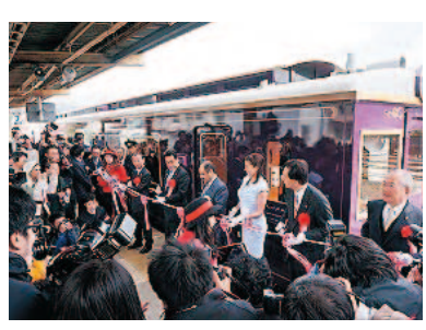
Ceremony for the resumption of all the lines on the South Rias Line (April 5, 2014)

Three years after the disaster, all the lines opened up again and they had been used as a tourism resource (such as an event train). They are established as a precious, invaluable asset in the local area.