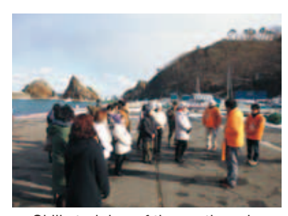
Skills training of the earthquake storytellers organizations (local training)