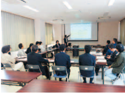
Exchange of opinions on the system implemented

Besides regular visits to the municipalities by Iwate Prefectural workers and the support project team, we also carry out operational support for the system and utilize opinion exchange (both as meetings and via websites) to collect users' opinions, so as to improve the system.