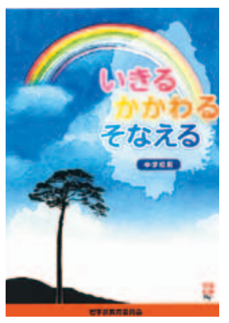
"Supplementary booklet" for junior high school