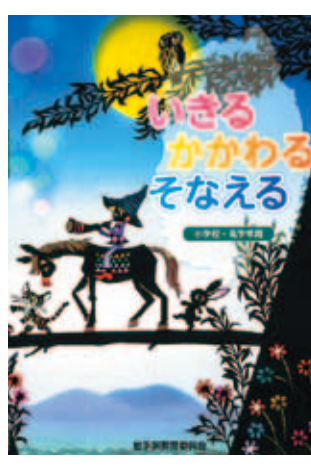
"Supplementary booklet" for higher grades at elementary school