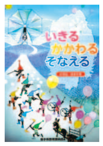
"Supplementary booklet" for lower grades at elementary school