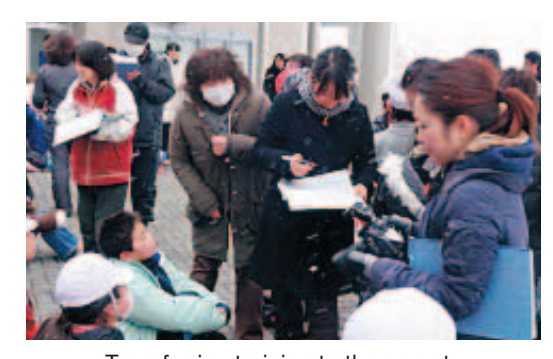
Transferring training to the parents (Yono Municipal Taneichi Elementary School)

Base on the manual of each school, safety confirmation after the all-clear has been given and transferring training are conducted through cooperation with families, immediately sending emails to guardians, use of transferring cards, etc.