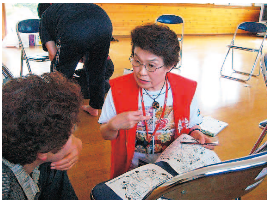
Nutrition counseling in temporary meeting place, etc.

This manual summarized the operations needed for each phase and determined the flow for creating health management activity teams if the scale of the disaster occurring in the prefecture is big enough to trigger "health management activities".