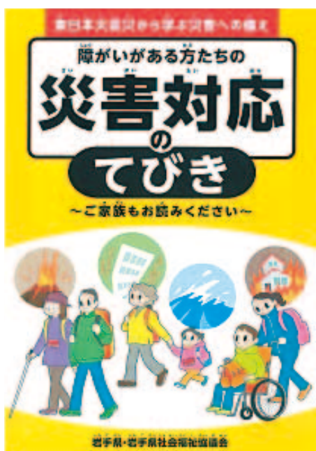
Cover of the Guideline

This new consideration for supporting people with disabilities includes writing information about their disabilities, their contacts, and necessary support on a “Please Card” bound in the “guideline”, so they can ask for help during an emergency.