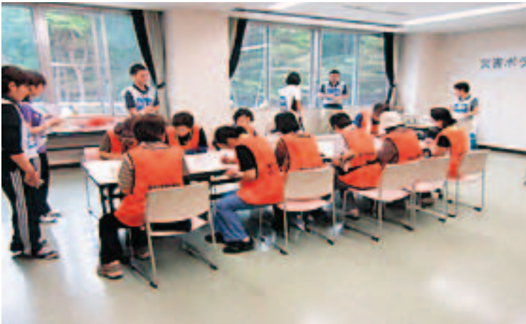
Training meeting of disaster volunteer support network