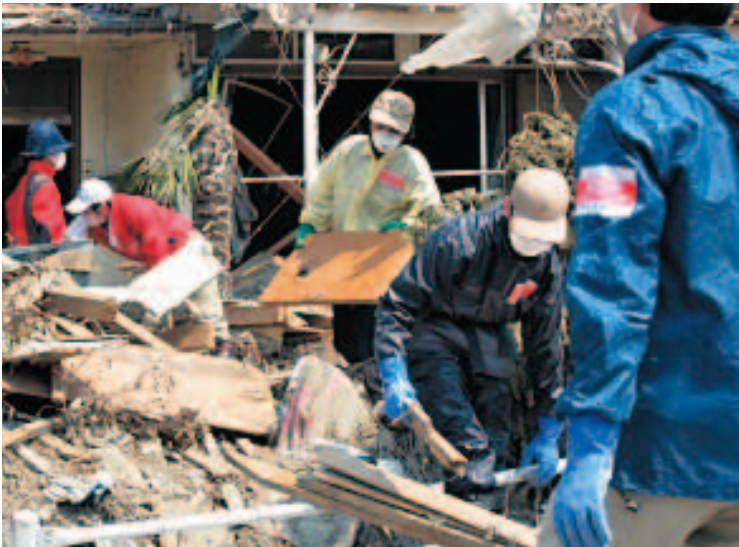
Volunteers removing rubble in areas affected by the Great East Japan Earthquake and Tsunami

Based on this guideline, the liaison meeting of “Iwate Prefecture Disaster Risk Reduction Volunteer Support Network” was established, and research sponsored by the same meeting was also performed actively through opinion exchanges in addition to building relationships with related institutions and organizations.