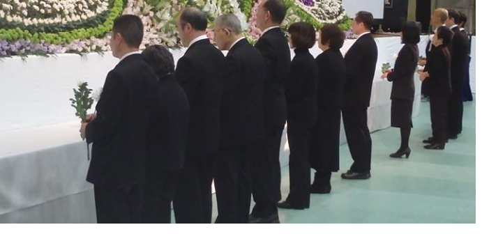
Bereaved relatives give flowers