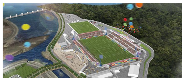
CGI image of how the stadium will look when it is completed

The total cost of hosting the event is estimated around 2.9 billion yen, and is expected to be a jumpstart for the reconstruction of Kamaishi.