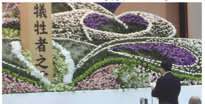
Governor Tasso makes his address