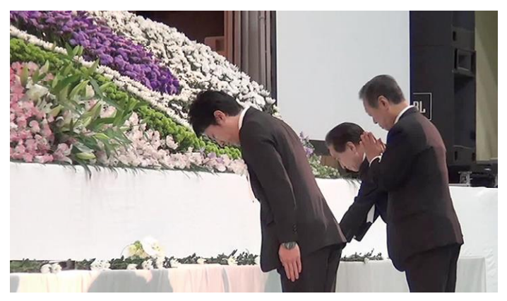
Invited guests give flowers and offer prayers at the ceremony

Iwate lost 5,122 lives in the Great East Japan Earthquake and Tsunami (4,672 as a direct result of the disaster, 450 in related incidents), and even today 1,129 people are still missing. (Information accurate as of February 28, 2015)