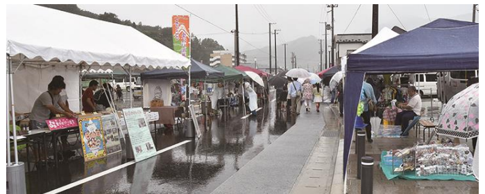
The lively Yoichi festival even in the rain

At Yoichi, there were about 30 shops on the Suehirocho-dori (street) where the shopping district once was. Support workers were dispatched, and booths were up selling local specialty items and promoting tourist destinations. Events such as mochimaki (scattering rice cakes), traditional folk arts, and traditional Japanese songs were performed at the main stage. Although it rained the whole day, the townspeople and those returning for obon season enjoyed the long-missed Yoichi festival.