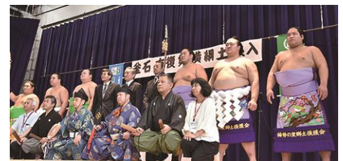
Sumo wrestlers and all involved members posing for a photo