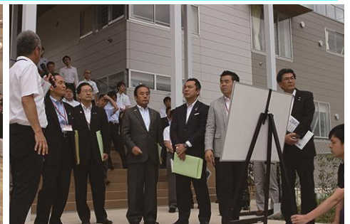
Prefectural governors visiting the coastal disaster-affected areas