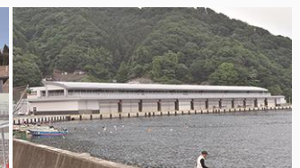
Restored Kamaishi Fish Market