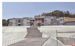
Kamaishi Higashi Middle School and Unosumai Elementary School rebuilt on higher ground.

The tsunami hit the city center (east of Kamaishi Station) and the waves ran up the Kasshi River that flows through the city for about 3.5km. The city hall and the fire station, which served as bases of operations during the disaster, suffered flooding, and fishing equipment and facilities along the harbor received extensive damage as well.