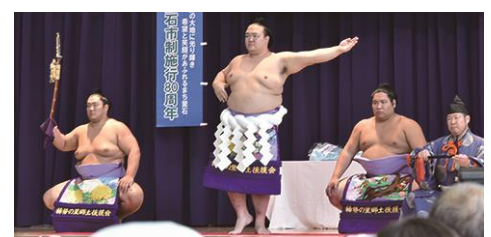
Dohyo-iri performed by Yokozuna Kisenosato

Kisenosato said, "Even if it's only for a little while, I want to support the survivors by making them happy. I want to return home with my mind and body toughened up (through this experience), and display a good example of sumo wrestling."