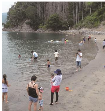
Okirai Namiita Beach