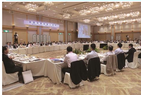
The National Governors Meeting