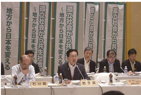
Governor Tasso reading out the Iwate Proclamation

Full text of the Iwate Proclamation (JPN only): http://www.pref.iwate.jp/seisaku/chijikaigi/057585.html