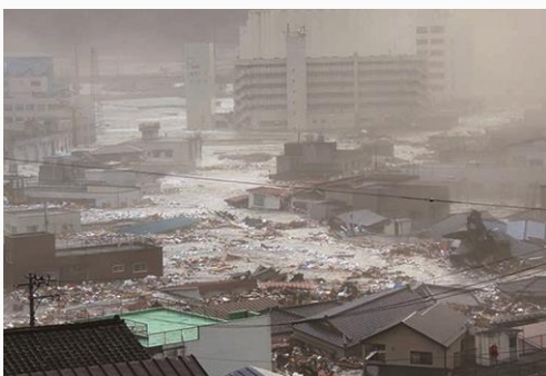
The tsunami devastates the city center

What happened that day? Let us look back at the disaster in each affected coastal area.