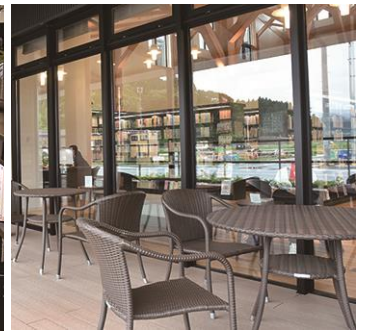
A terrace space for reading to also enjoy the outdoors