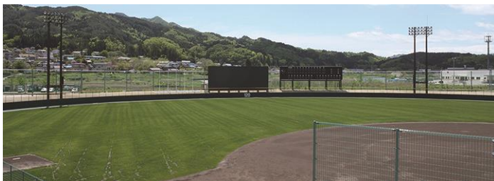
Baseball field in the newly reconstructed Miyako Athletic Park

On July 29 (Sat), to commemorate the renewal of the park, the baseball field was used to host the Tohoku Rakuten Eagles vs Yokohama DeNA match of the Eastern League Professional Baseball Competition. Additionally, on the 30 th (Sun), track-and-field classes were held by the runners of the Mizuno Track Club (a prestigious athletic club). With the park's completion, there are high hopes of revitalizing the local area through sports.