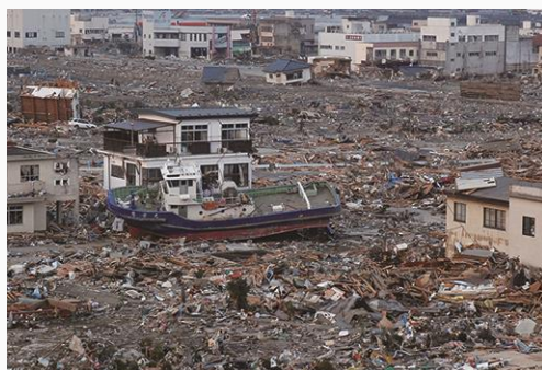
A fishing boat that was carried inland