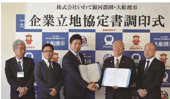
The signing ceremony

This is the first time Ofunato City has attracted a new enterprise to an area damaged by the tsunami. The total area of the new facilities, including tomato cultivation and processing buildings, is around 32,000 square meters. Construction is due to begin in October, and end in 2018, and 30 to 50 people will be employed at the site.