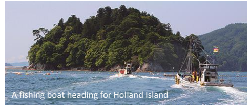
A fishing boat heading for Holland Island

Dates ■ June 1 – October 31 * We may not be able to accommodate you on certain days due to fishing conditions in Yamada Bay. * Tours may be cancelled suddenly due to weather. Participants ■ One group per day (4-6 people) Fee ■ ¥5,000 per person * Please apply as a group of 4-6 people. Time ■ 9:00 – 10:30 Application ■ Reservations must be made at least 7 days in advance. Inquiries ■ Yamada Wonderful Experience Bureau Tel: 0193-82-3111 (Extension 227) 8:30 – 17:15 (Closed on weekends and holidays)