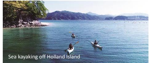
Sea kayaking off Holland Island