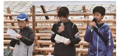
An elementary school student makes a pledge