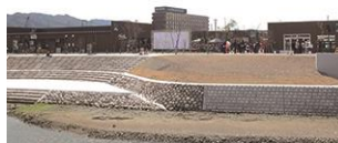
Kyassen Ofunato, a shopping facility which opened in Ofunato city center

Many regions suffered severe damage, but the damage to buildings in the Yoshihama section of Sanriku, which faces Yoshihama Bay, was relatively low. After learning from tsunamis in the past, a plan was implemented to keep farming and fishing in the lowland areas, but to relocate homes to higher ground, so this resulted in less damage during 3.11.