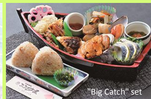
"Big Catch" set

■ Inquiries ■ Sanriku Railways, Passenger Services TEL: 0193-62-8900 (9:00 - 18:00)