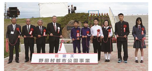
The ribbon-cutting ceremony

Work on Tofugaura Park, which is situated within an area vulnerable to tsunamis, began in May 2013. The park is designed to help reduce potential damage. Its 19 hectares contain 6 different regions, including a multi-purpose event space, an activity space, Noda Forest, observation and rest facilities, and a seafront area. It's sure to become a peaceful haven for the village.