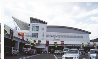
The restored Ofunato Fish Market