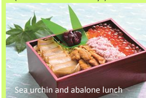
Sea urchin and abalone lunch