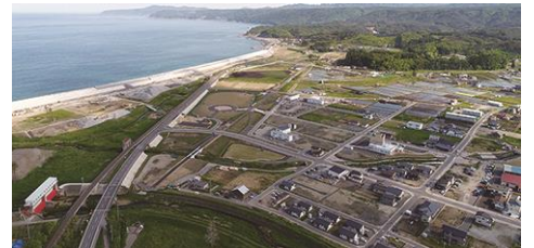
The newly-created Tofugaura Park