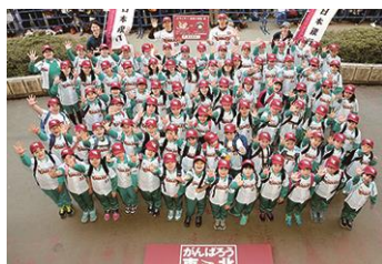
The commemorative photograph

The Tohoku Rakuten Eagles managed to win the match, thanks to a timely go-ahead play by Ginji. As he took to the stage for a post-match MVP interview, he was greeted by a huge roar from the crowd.