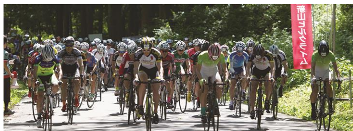
The riders, racing towards the Shinyama Plateau.

The competition is expected to give a boost to bicycle tourism in the Sanriku coastal region.