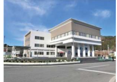
Omoto Tsunami Prevention Center

In case of a disaster, the center is equipped with power generators and solar power, as well as blankets and emergency rations. The region was badly damaged five years ago; this facility is expected to be an important part of the new disaster preparedness efforts.