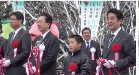
The ribbon cutting ceremony