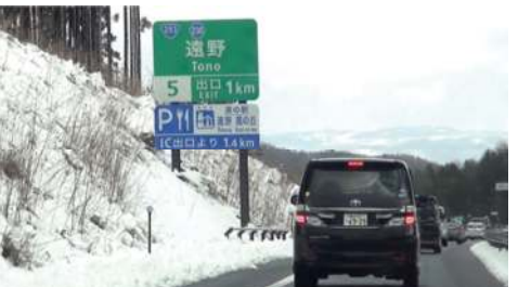
The newly opened road between Miyamori IC and Tono IC