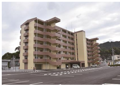
Shimotateshita Apartments, the last of Ofunato's new housing

As of late September, Ofunato has 464 emergency, temporary homes in use across 25 districts (not including those currently being demolished). Of the 801 new homes, 641 have been filled (419 by Ofunato City, 222 by Iwate Prefecture).