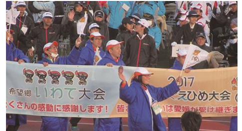
The team from Ehime, next year's host, at the closing ceremony

The theme of the exhibit was "We want to show our thanks and tell people