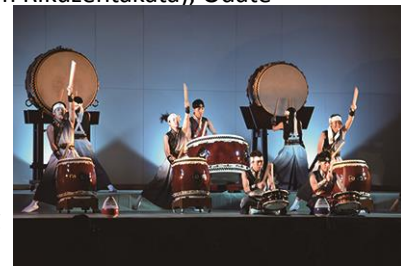
"Byakko" makes an impact

The well-practiced performances and beautiful stickwork earned cheers and applause from the audience. The performers included the Kesen Fighting Tanobata Preservation Society (from Rikuzentakata), Odate Magewappa Taiko (from Odate, Akita) and Tajima Tatumikai's Byakko (from South Aizu, Fukushima), who shined brightly at the Japan Taiko Tournament by winning its junior category.