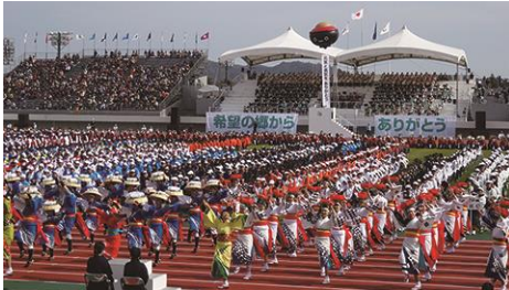
Sansa Odori performance by approx. 700 people