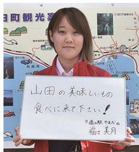
"Please come to eat delicious food in Yamada!"