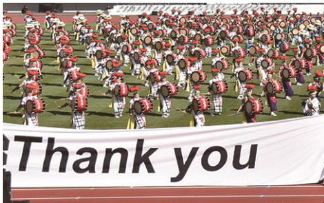
700 Sansa Odori dancers

At the official opening ceremony, starting with Okinawa, teams from all 47 prefectures entered the arena. The athletes and fans then observed a minute's silence out of respect for those who lost their lives in the disaster.