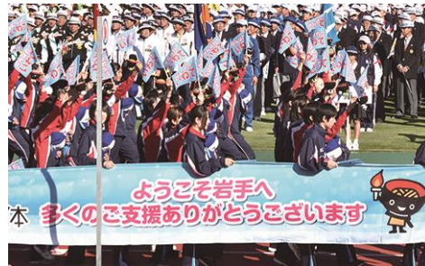
Iwate's team entering the stadium