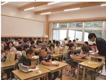
Children attending class in the new school building

The wood is taken from Japanese cedar and larch trees in the town. The school also has an indoor exercise room, an indoor pool, library, and a cafeteria. It has been designated as an evacuation site during times of disaster.