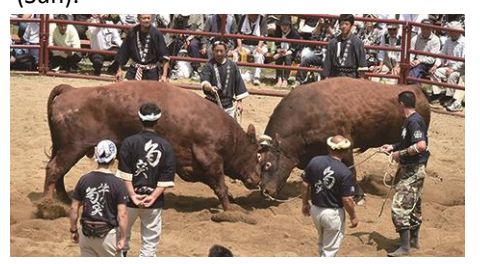
The bulls facing off in battle.

The Hiraniwa Highlands will host the "Shirakaba Tournament" on August 21st (Sun).