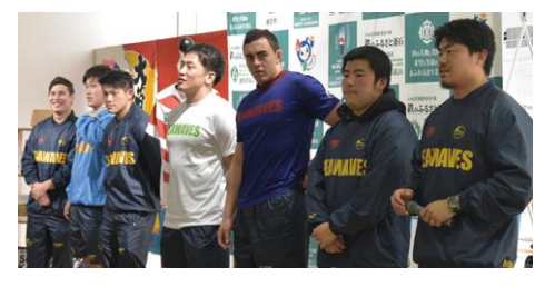
Players from Kamaishi Seawaves RFC attend the opening ceremony