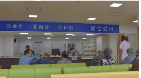
Outpatient care at Otsuchi Prefectural Hospital