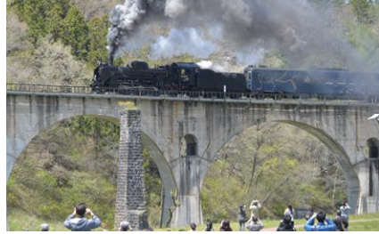
Spectators taking pictures of the SL Ginga

Sakari Station (Ofunato City) that will match with the arrival of the SL Ginga in Kamaishi. The trains' operations are expected to provide an enormous amount of support for the coastal regions.