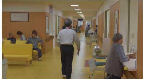
The hospital interior