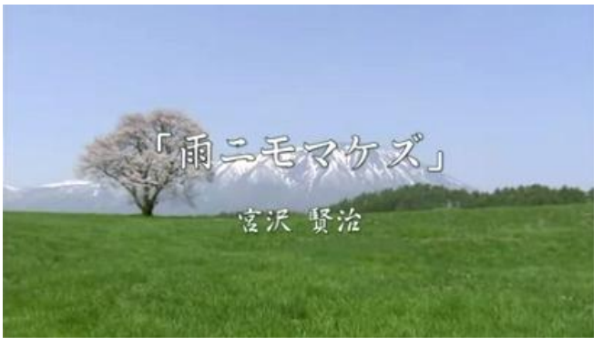
Be Not Defeated by the Rain (scenes of nature and of life)