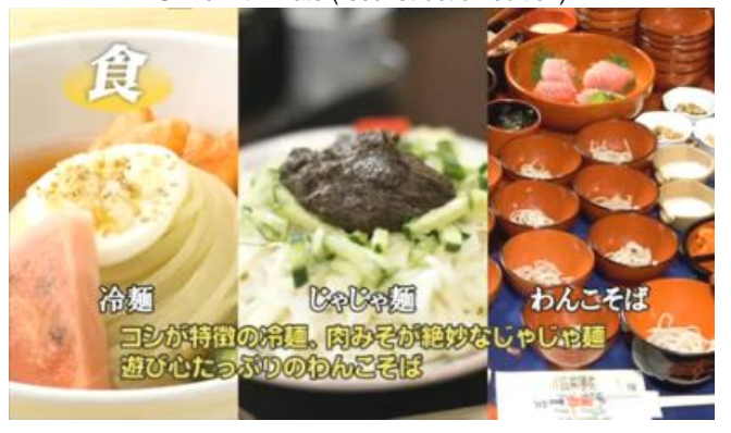
Smiles in Iwate (Golden Iwate edition)