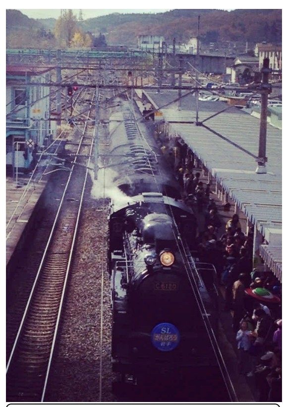
The 'Keep Fighting Iwate!' Steam Train preparing to depart Ichinoseki Station.

Along with the passengers, many locals and amateur photographers crammed along the train line to catch a glimpse, and were invigorated by the imposing figure of the train as it slowly yet powerfully moved forward trailing white steam. Who could not feel that the train represented Iwate's steady progress on the path to recovery?