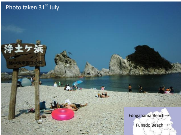
Photo taken 31 st July

Also, 26 th July was reported to be the official end to the rainy season in Iwate Prefecture! Since the end of the rainy season, there have been many days with a high temperature of over 30 degrees.