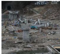
Site of Shimanokoshi station which was damaged heavily

The train service between Omoto ~ Tanohata Station is expected to restart by April 2014.