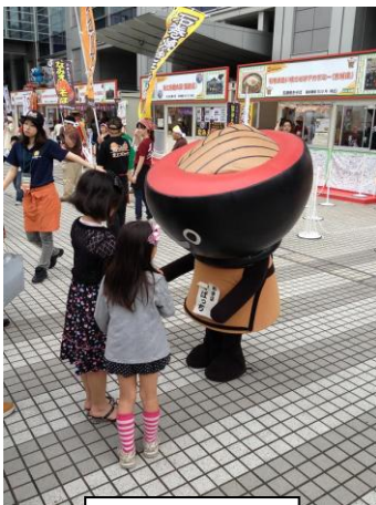
Sobacchi greets children