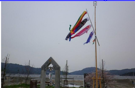
Photograph taken at Yamada Town on 30 th April.

This is the "Bell of Requiem and Hope" monument built at the site of the destroyed town library. In the distance, one can enjoy the sight of cherry blossoms in full bloom and the Yamada Bay.