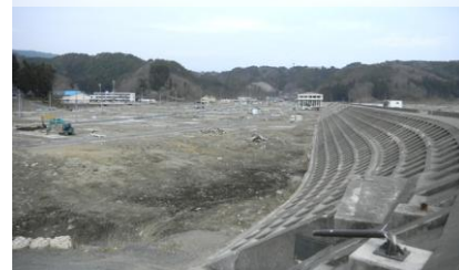
A photograph of Ofunato City taken on 25 th April.