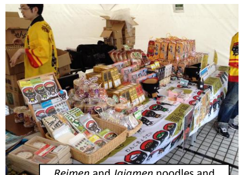
Reimen and Jajamen noodles and Wanko Kyodai goods were also a hit

>>> "For Details on the United States of Michinoku, please see here: http://www.fujitv.co.jp/fujitv/news/pub_2012/120508-147.html