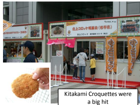
Kitakami Croquettes were a big hit