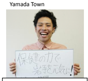
"We will make Iwate better with healthcare! It's not about 'aid' but 'cooperation. By working together we can create a wonderful Iwate!"

Feeling that the people who are in their teens and 20s now would need to become the leaders of the town in the future, he got together with students and formed "Kakkii's".