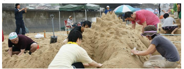
A dinosaur made out of sand

Around 130 people both from within Otsuchi and elsewhere gathered at the event. They broke up into teams, and with