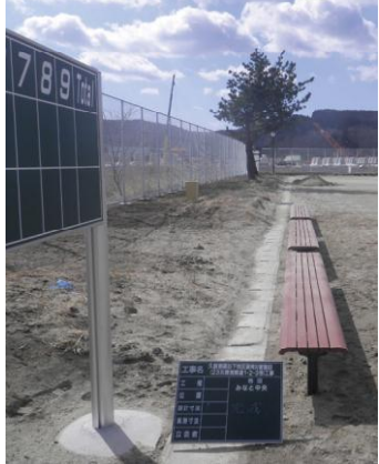
After restoration work

We are recruiting members for the Iwate Reconstruction Supporters Team!