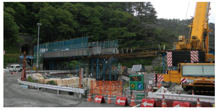
Work on the land bridge between Tanohata and Shimanokoshi Stations. **The substructure is completed, and work on installing the beams has begun.

Works on the Sanriku Railway North Rias Line's Shimanokoshi Station, which lost both its main building and land bridge in the tsunami, continue in earnest. It is hoped that in April 2014, the currently inactive 10.5-km stretch between Tanohata and Omoto Stations will be fully up and running again.