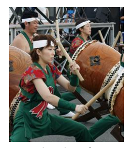
Yamaguchi Daiko performance