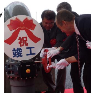
The completion ceremony in progress

This hatchery is planned to be shared with neighboring Fudai Village, and will be used to raise around 12 million young fish that will be released next spring.