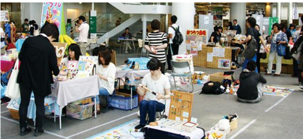
Photo: Crowds gather at the bazaar

The 173,781 yen collected this time, as well as the 838,629 yen collected at the six previous bazaars, are being donated to the Iwate Prefecture Disaster Relief Charity Committee.