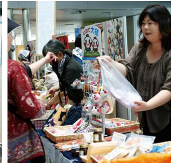
A vendor from Otsuchi Town