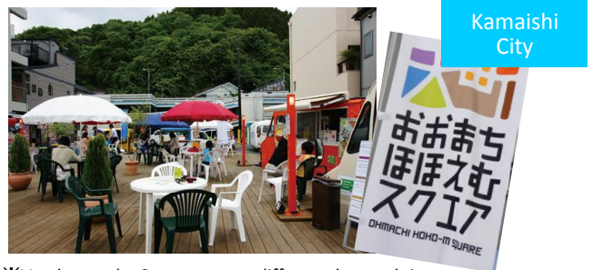
※Vendors at the Square vary at different days and times.

Afterhours some of the shops also serve alcoholic beverages, and the Square is quickly becoming a popular gathering place in the heart of Kamaishi City.