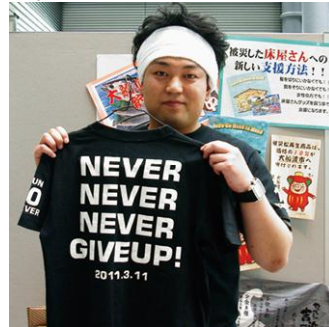
A vendor from Ofunato City