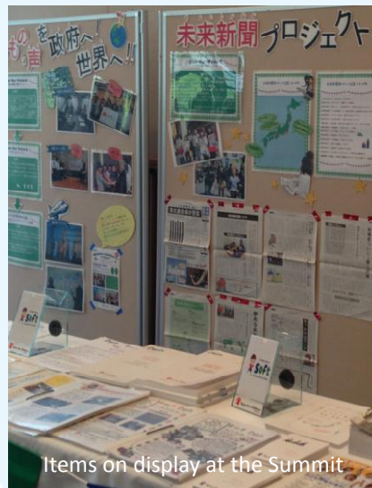
Items on display at the Summit