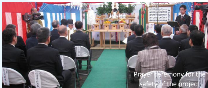
Prayer Ceremony for the safety of the project

Yamada Town hopes to hold the graduation ceremony for the current 6 th graders in the new school building, so they are pinning their hopes on the project's speedy completion.