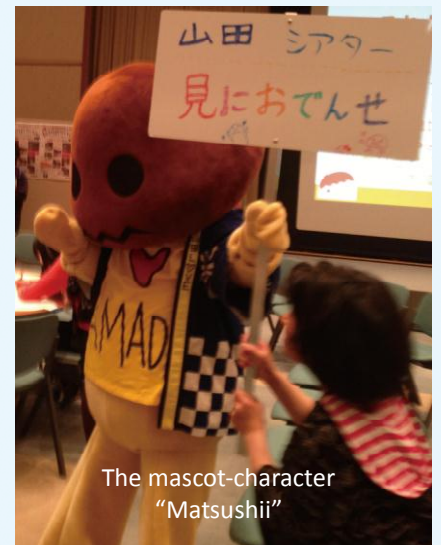
The mascot-character "Matsushii"