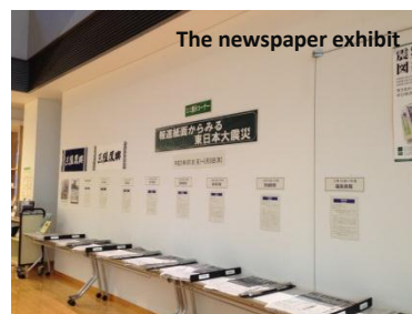
The newspaper exhibit

100 photos taken by Nikkei reporters of the disaster area in the immediate aftermath. A display of relevant newspaper articles is also being organized.