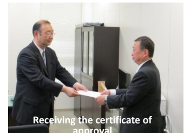
Receiving the certificate of approval

On Friday, April 12, the Prime Minister officially approved Iwate's "Confirmed Contributory Pensions Special District Reconstruction Promotion Plan". With this, those who meet certain requirements and were entered into the confirmed contributory pension scheme (either through their company or individually) at the time of the Great East Japan Earthquake will be able to withdraw before they reach the age of 60. A one-time lump sum at time of withdrawal can be used to help rebuild their lives. Further details are available from the Iwate Reconstruction Net website .