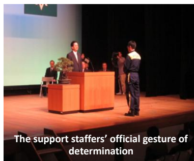
The support staffers’ official gesture of determination

During the ceremony, Governor Tasso issued words of encouragement, and a representative of the support staff made an expression of resolve on their behalf. The workers’ enthusiasm was evident.