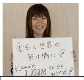
"I want to be a bridge between Kamaishi and the world! Kamaishi LINK to the world!"

been pouring her efforts community-building.