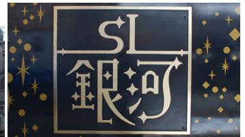
The "SL Ginga Tetsudo" plate on the passenger cars