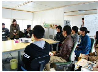
The opinion exchange