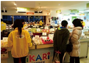
Regional Goods Galore!

Almost three years have passed since the disaster. Around 100 small and medium businesses are taking part from the still-recovering affected prefectures. The event is taking place simultaneously in Iwate Prefecture, (Morioka), Miyagi Prefecture (Sendai) and Fukushima Prefecture (Fukushima).