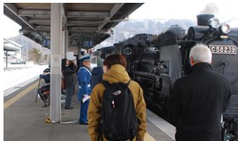
Tourists gather round the test-run