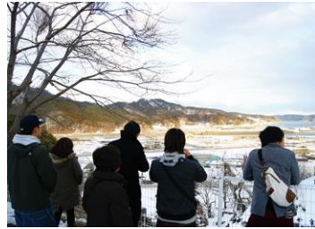
Looking on Otsuchi from Shiroyama Park