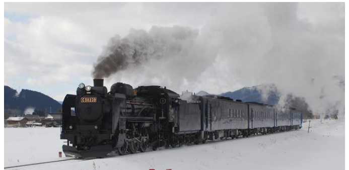
A test-run by the SL Ginga Tetsudo

This will be a powerful push for the reconstruction along with April's complete reopening of the Sanriku Railway.