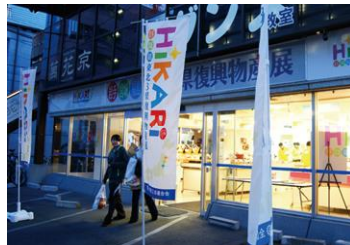
Outside the shop

Roughly 600 different products are on sale, including unique regional goods and goods produced using local agriculture, commerce, and industrial resources.