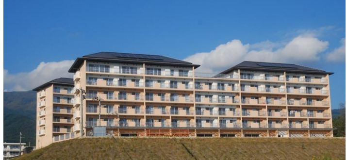
he completed Shimowano Housing Complex

There are 12 disaster housing units planned within Rikuzentakata with a total of around 1,000 apartments.