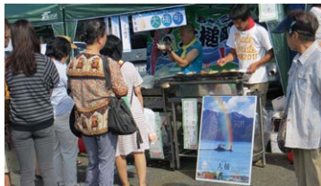
Otsuchi's hotate-yaki (scallop)