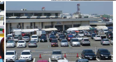
Yokohama South Market, where the summer festival took place