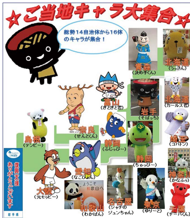
Local mascots from various Japanese local governments who have sent support workers to Iwate

Many young people are diligently helping the affected area of Sanriku move toward a full reconstruction. The new section "People for Sanriku's Future" introduces one of these young people and their powerful feelings every issue.