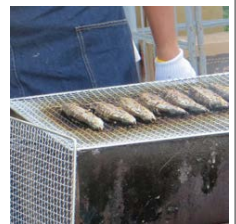
Ofunato's sanma-yaki given out for no charge

That people who volunteered in the affected areas had come to the event made the feeling of support all the more apparent. Also, in spite of the fierce heat at 34.5°C, there was a long line for Ofunato's 10,000 no-charge sanma-yaki.