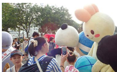
Parade attendees taking pictures of the mascots.