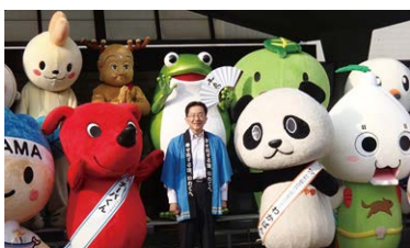
Commemorative photo of the mascots with Governor Tasso.

Among the people watching the parade alongside the road, there were people who cheered and shouted the names of the mascots, and the mascots waved in return, making it fun for all the parade attendees.