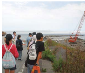
Field trip to Omoto harbor

In Omoto harbor, the land sunk by 40-50 cm due to the earthquake, and the 450m breakwater was destroyed by the tsunami. The reconstruction work on the breakwater should be finished by fall of this year, and the participants went to see its progress.