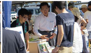
"Comic Iwate" Manga edited by the governor (Center: Governor Tasso)