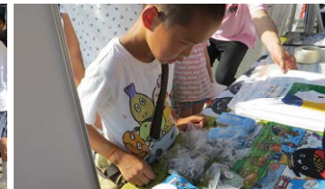
Iwate tour PR booth