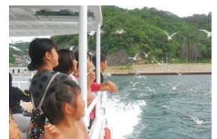
The participants experiencing the Kitayamazaki Cliff Cruise

While on the cruise, they were also able to learn about the extent of the damage from the disaster, and the history of the Sanriku area.