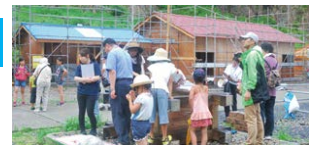
The fieldtrip in Tsukuehama Banyagun

Before the disaster, this was a tourist area where visitors could come and see fishermen drying wakame and konbu seaweed, and the lifestyle of the fishermen (through Banyaga food and the likes), but 25 of the buildings were completely washed away by the disaster. At present, 23 of the buildings are being restored, and the participants went to see its progress.