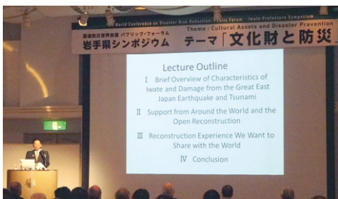
The Iwate Prefecture Symposium (Ichinoseki)