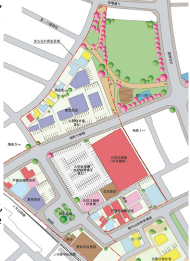
Image of the Urban Revitalization Plan

Construction will cost approximately 690 million yen, with 70% covered by the national Reconstruction Agency, and the project is planned to be completed by March 2016.