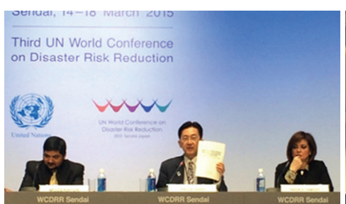
Governor Tasso explaining the proposals from Iwate Prefecture