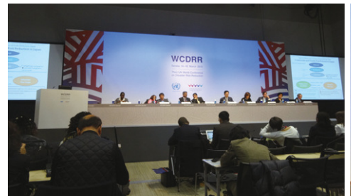
The Third UN World Conference on Disaster Risk Reduction (Sendai)

In coordination with the conference, Iwate Prefecture held a symposium in Ichinoseki on March 17 (Tues.) about cultural assets and disaster prevention. Study tours were also held in the tsunami-affected coastal region between March 16 and March 18.