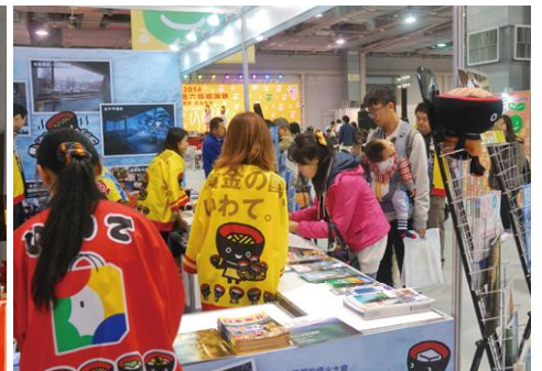
Iwate's promotion booth

~To A New Homeland~ Iwate Sanriku Reconstruction Forum