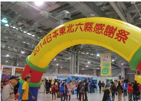
The Japan Tohoku Six Prefecture Thanksgiving Festival

This event was not just an event to promote the prefecture, but was also a four-day event that deepened the bonds between Iwate and Taiwan even more than before.