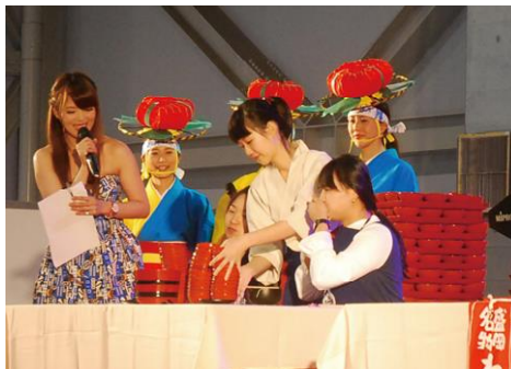
Taiwanese participants in a Wanko soba competition