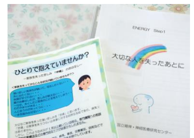
ENERGY support service