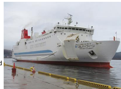
Silver Queen

The 325km route between Miyako and Muroran is projected to take 10 hours roundtrip. The service will run once a day. The ferry is expected to have a positive impact on tourism and distribution.