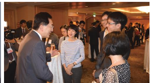
Scenes at the reception