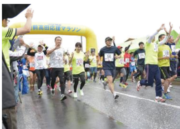
The participants at the starting line

Crowds lined up on the roadside to cheer on the runners, who had messages of support for Rikuzentakata attached to their backs.