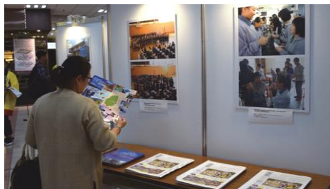
Guests viewing the display boards