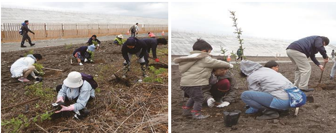
Participants work to plant trees

Last October, roughly a thousand black pine trees were planted within 0.2 hectare as commemoration of the replantation of a natural, tide-water control forest (hosted by the Prefectural Northern Iwate Regional Development Bureau, Noda Village, and Iwate Prefectural Greening Promotion Committee - Noda Branch). The district aims to completely restore the forest by the end of March 2020.