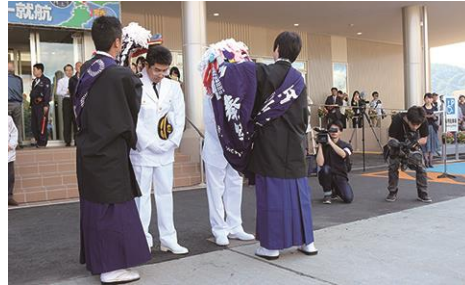
Kuromori Kagura spiritual strengthening