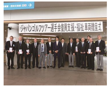
Commemorative photo of the presentation ceremony