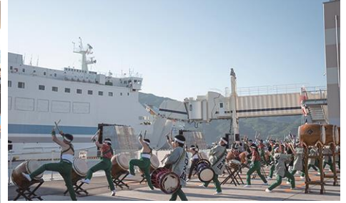
The ferry is greeted by Miyako's Yamaguchi Taiko group