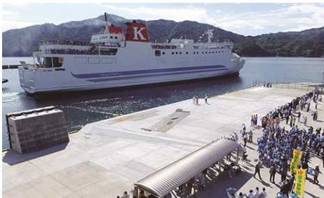
The Silver Queen departs from Miyako Harbor

This, along with the new Sanriku coastal highway, is expected to attract more visitors to the area, while simultaneously serving to better facilitate the distribution of goods.