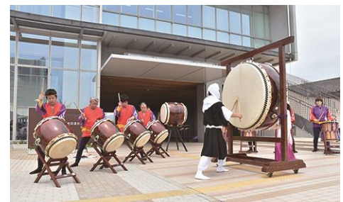
Semi Onsen Traditional Arts Preservation Society's drum group's performance

We are recruiting members for the Iwate Reconstruction Supporters Team!