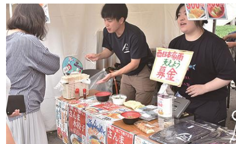
An Ofunato City business offering saury dumplings