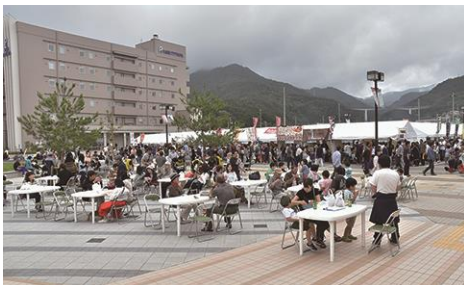
The Sanriku Food Court

Also, in addition to a PR display for the 2019 Rugby World Cup™, Ofunato City put on a display in collaboration with Mogami Town in Yamagata Prefecture (its sister city) starring the Semi Onsen Traditional Arts Preservation Society's drum group. It was two days of regional exchange and enjoying the best of what the Iwate coast has to offer.