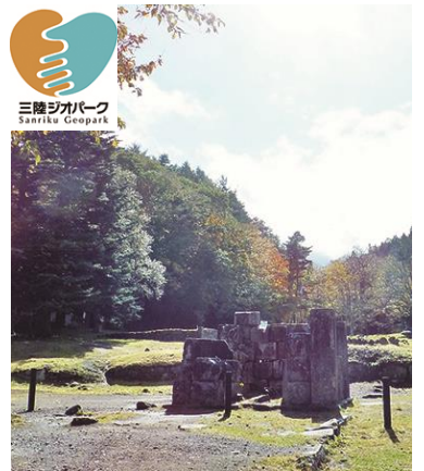
The third blast furnace at the Hashino Site

The Hashino Iron Mining and Smelting Site was added to the World Heritage list in 2015, as one of the "Sites of Japan's Meiji Industrial Revolution." It includes Japan's oldest remaining western-style blast furnace ruin, the Hashino Blast Furnace. Visitors can enjoy the site via augmented reality (AR), using an app that offers aerial photos, a cross-section of the furnace, and a look at the structure of the equipment.