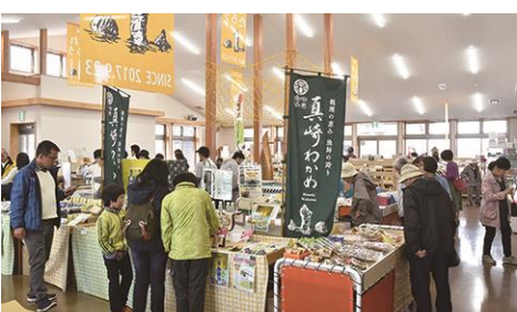
The popular "Sanchoku Toretaro" shop