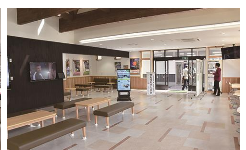
The free rest space, with travel information