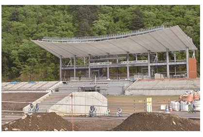
Construction work on the Kamaishi Unosumai Reconstruction Stadium (name TBD)