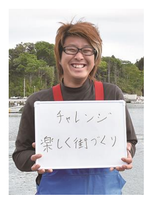
Let's challenge ourselves to have fun while rebuilding the city!

delicious season, so the ones from the spring season were given the brand name, "Thawed Oysters".