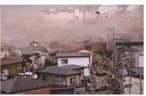
The approaching tsunami

What happened that day? In this section, we will be looking back at the disaster in each coastal town.