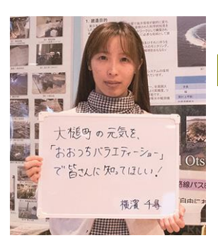
"I want everyone to see Otsuchi's vitality through the Otsuchi Variety Show."

disaster. I will be glad if people slowly feel that liveliness is returning to Otsuchi by hosting a big event with everyone," she comments.