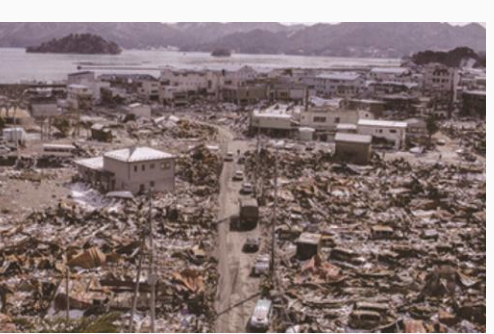
The central region, destroyed by tsunami and fires