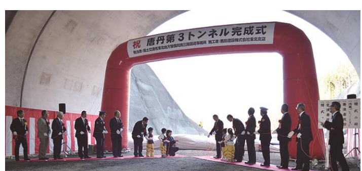
The completion ceremony

reconstruction are expected to give a boost to both tourism and local business.