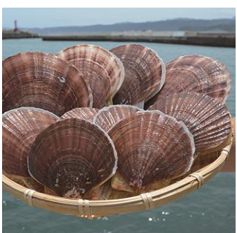
The registered Iwate Noda Town's Araumi Scallops