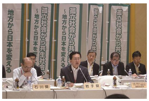
Governor Tasso reading out the Iwate Proclamation

Full text of the Iwate Proclamation (JPN only): http://www.pref.iwate.jp/seisaku/chijikaigi/057585.html