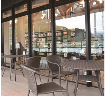
A terrace space for reading to also enjoy the outdoors