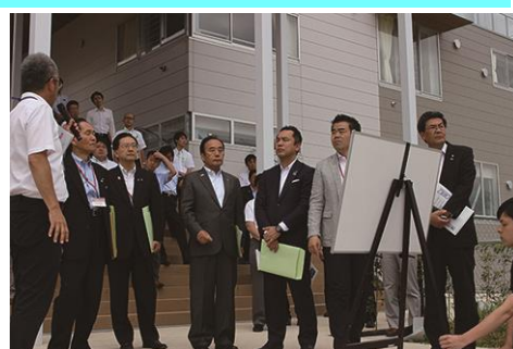
Prefectural governors visiting the coastal disaster-affected areas