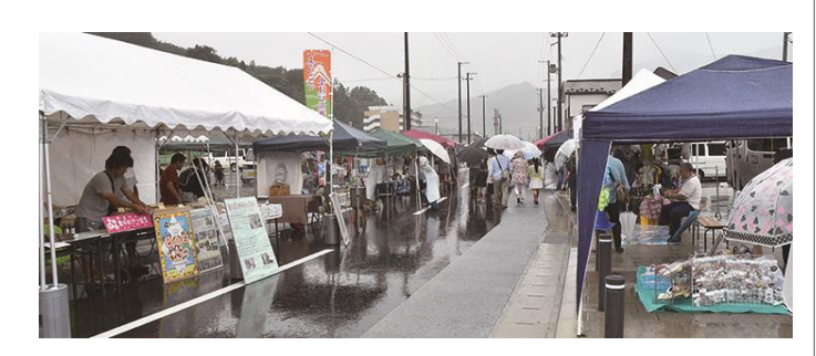
The lively Yoichi festival even in the rain

At Yoichi, there were about 30 shops on the Suehirocho-dori (street) where the shopping district once was. Support workers were dispatched, and booths were up selling local specialty items and promoting tourist destinations. Events such as mochimaki (scattering rice cakes), traditional folk arts, and traditional Japanese songs were performed at the main stage. Although it rained the whole day, the townspeople and those returning for obon season enjoyed the long-missed Yoichi festival.