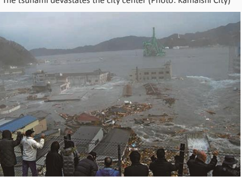
The tsunami hits Kamaishi harbor