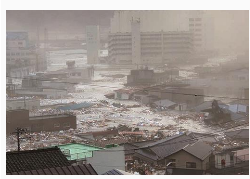
The tsunami devastates the city center

What happened that day? Let us look back at the disaster in each affected coastal area.