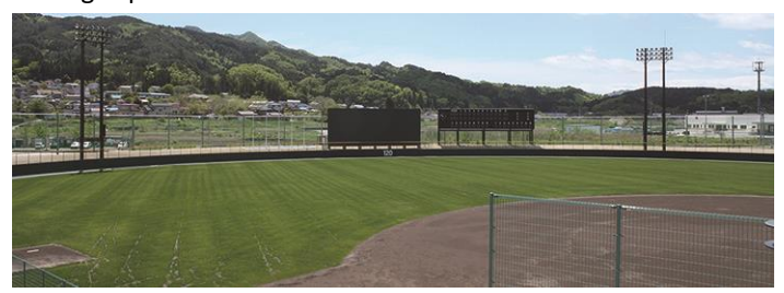
Baseball field in the newly reconstructed Miyako Athletic Park

On July 29 (Sat), to commemorate the renewal of the park, the baseball field was used to host the Tohoku Rakuten Eagles vs Yokohama DeNA match of the Eastern League Professional Baseball Competition. Additionally, on the 30<sup>th</sup> (Sun), track-and-field classes were held by the runners of the Mizuno Track Club (a prestigious athletic club). With the park's completion, there are high hopes of revitalizing the local area through sports.