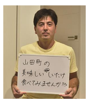
Comment from Mr. Haga: Would you like to try Yamada's delicious shiitake?

and eventually sell the harvested mushrooms at the Yamada roadside station. During peak growing times, I use about 1,000L of kerosene oil a day to make dried shiitake mushrooms. "